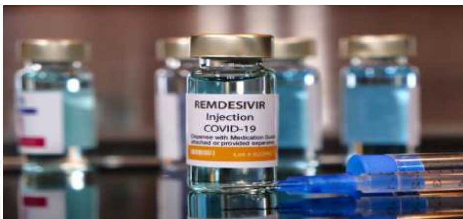
Fig. Remdesivir Injection.

that perturbs viral replication, originally evaluated in clinical trials to withdraw the Ebola outbreak in 2014. Subsequent evaluation by numerous virology laboratories demonstrated the ability of remdesivir to inhibit coronaviruses replication, including severe acute respiratory syndrome coronavirus (SARS-CoV-2). Coronaviruses are the family of enclosed viruses with a positive-sense, single-stranded RNA genome that infects animal species and humans. Coronaviruses primarily cause respiratory and intestinal infections in humans and animals. Discovered in 1960s, they were originally thought to be only responsible for the mild disease. That changed in 2003 with the SARS pandemic and in 2021 with the outbreak of middle east respiratory syndrome MERs, both zoonotic infections that results in mortality rates greater than 10% and 35%, respectively. Evidence also supports that the novel coronavirus which come out in the Wuhan region of China in late 2019 also originated from bats. This novel coronavirus, severe acute respiratory syndrome corona virus 2, resulted in an outbreak of the pathogenic viral pneumonia in Wuhan, Hubei Province, China, as reported to the World Health Organization (WHO) in December 2019.